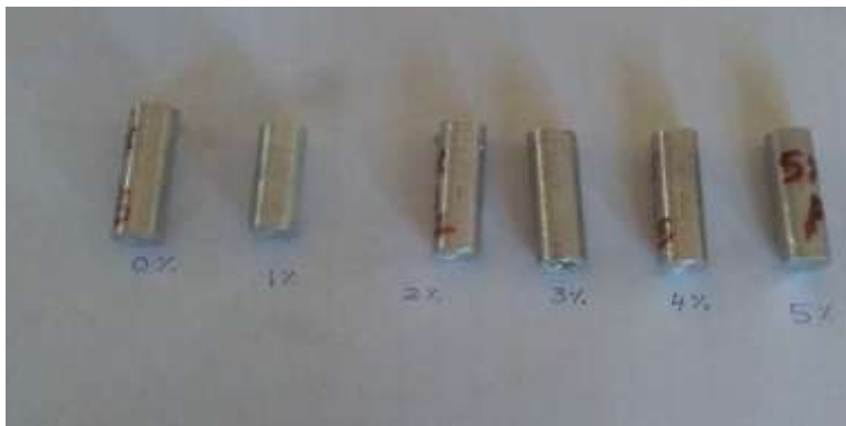
Figure1 AL2024/WC composite Wear specimens

In this study, AMC was developed by using AA 2024 as primary alloy phase and WC reinforcement particle as secondary phase. The use of WC in a composite will have the size of 60\mu . Stir casting technique is one of the liquid metallurgical techniques adopted in preparing composites because of its economic nature. During the process, the base alloy was melted to a temperature of 660^{\circ}\text{C} and the temperature was further increased to a temperature from 750^{\circ}\text{C} to 800^{\circ}\text{C} then the pre heated WC to the temperature of 400^{\circ}\text{C} was added to the melt for different composition of WC in the proportion 0, 1, 2, 3, 4 and 5wt% [11, 12]. The proper mixture was poured into a permanent mould cavity of standard size 12 mm diameters and 250 mm length by proper stirring to a speed of 450rpm using mechanical stirrer. After solidification these specimens are machined to suit the requirement of ASTM as shown in Figure (1) and wear test was performed for different loading condition followed by SEM analysis for worn out surface to identify the superior properties of AA-WC composites.