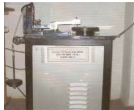
Figure 2 Pin on Disc wear testing machine

Wear test- Pin on disc method is employed to check the wear behavior of composites as shown in Figure (2). The specimen under goes sliding wear test has to be forced against SiC abrasive paper of 220, 320, 400 of grit and it is attached to the pin on disc machine, exactly perpendicular to the rotating disc. An applied load of 10N, 30N and 50N were applied for each specimen with varying percentage of WC [4]. Initially the pinned specimen was weighed using standard weighing machine. The prepared pinned samples with varying % of WC composites were subjected to above test to analyze the effect of applied load and varying % of WC. For statistical purposes, three runs were performed with different samples for each wear condition using new