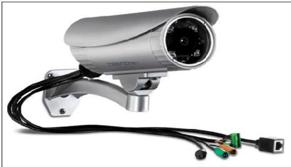
Fig. 2: CCTV camera