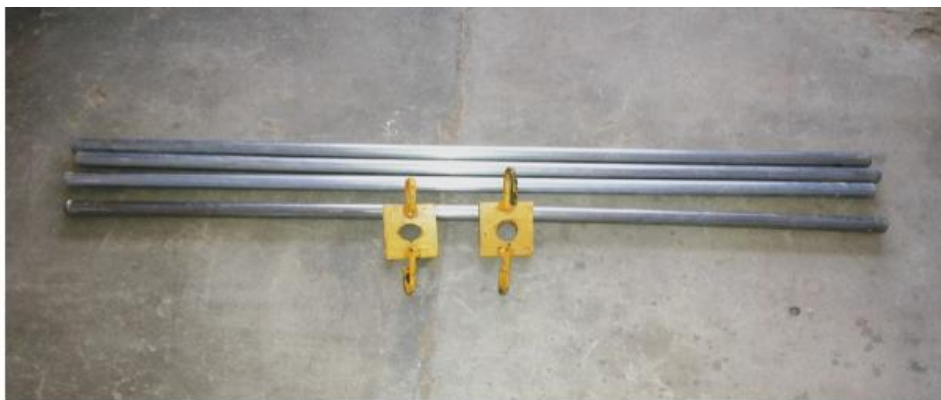
MODEL PILES & PILE CAP