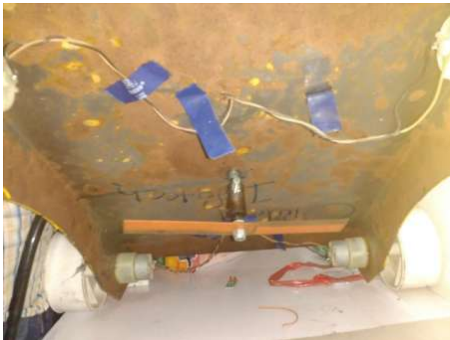
fig. MODEL OF SOLAR POWER AUTOMATIC LAWN GRASS CUTTER