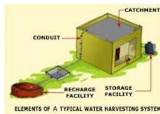
Figure 3. Rainwater Harvesting System adopted today

A rainwater harvesting system comprises components of various stages – transporting rainwater through pipes or drains, filtration, and storage in tanks for reuse or recharge. The common components of a